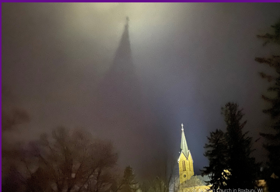
St. Norbert Church in Roxbury, WI