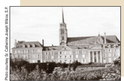
The Motherhouse of the Sisters of Providence at Ruillé-sur-Loir.