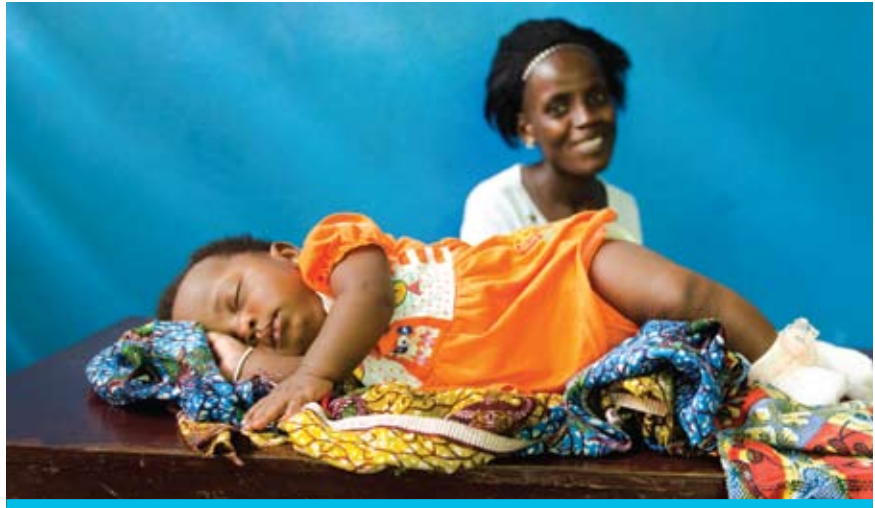
A patient and her daughter at Star of the Sea Health Center wait to receive postnatal care in Monrovia, Liberia. CRS support has helped Star of the Sea and many other health clinics stay open, and keep workers safe and communities healthy throughout the Ebola outbreak.