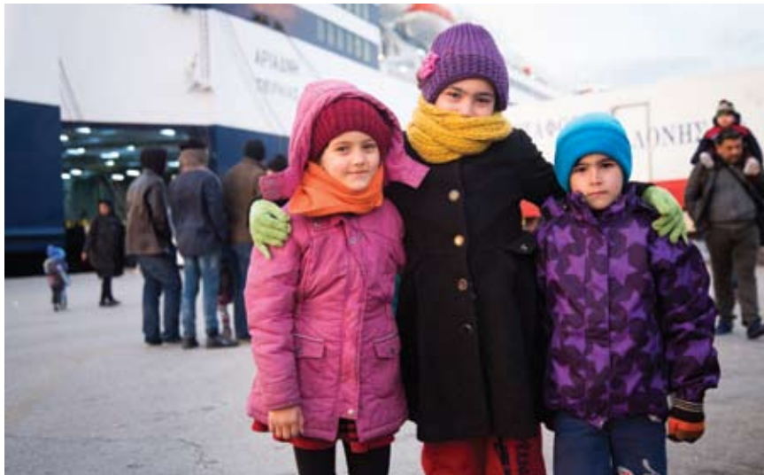
CRS partner Caritas Athens runs a day center for refugees and migrants. Part of their outreach is to meet arriving refugees at the port to keep them from being exploited by smugglers. Here a group of Afghan girls arrives in Athens.

This update provides the latest reports from Catholic Relief Services teams and partners carrying out vital emergency relief and recovery efforts around the world. Our work is possible thanks to the generous support of private and public donors, the dedication of local partners, and the unwavering presence of Caritas and the local Catholic Church.