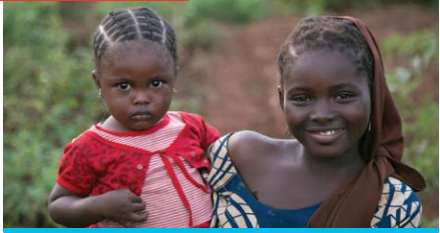
In Boda, families have received seeds and tools from CRS to jumpstart their livelihoods.