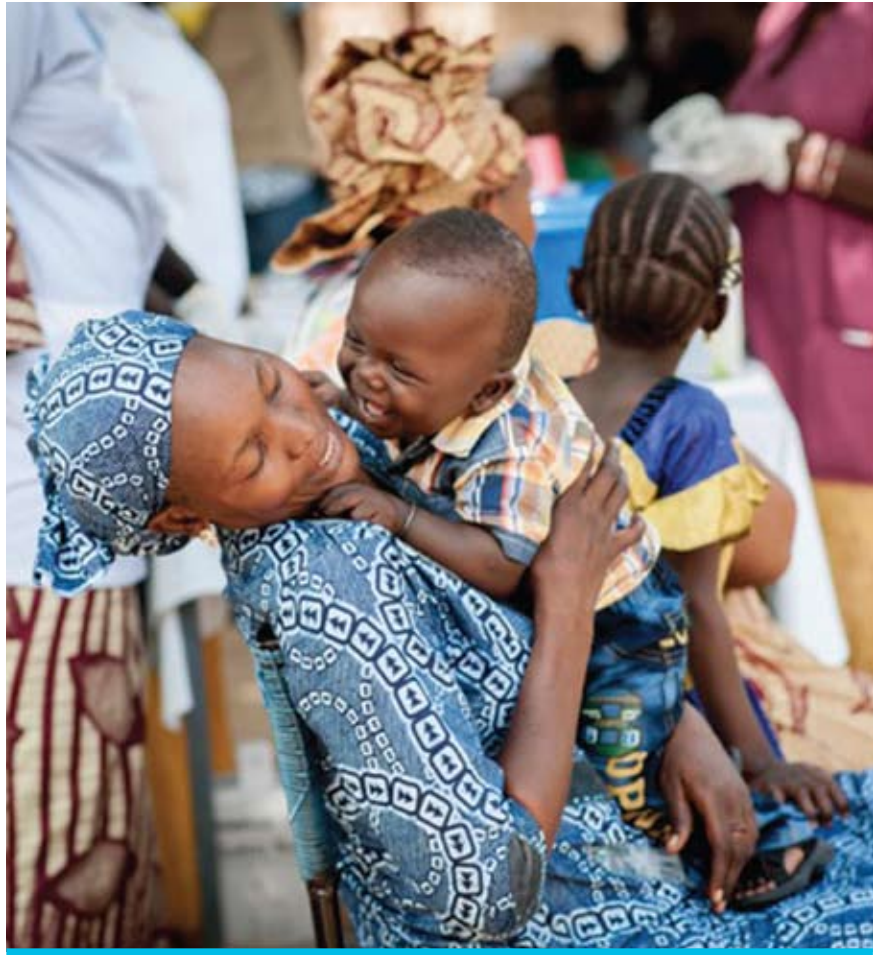
Families await medicine provided by CRS during the launch of a malaria prevention program. CRS is building on its programs and partnerships in the country to respond to escalating humanitarian needs caused by recent crises.

Despite improved rainfall and security in parts of the country, 2.5 million people are estimated to be in need of humanitarian assistance this year. This includes 709,000 malnourished children and 825,000 people in need of clean water. The needs are especially pressing in Timbuktu. A food and nutrition crisis is on the rise: More than 15 percent of the country's population is without sufficient food, with 12.4 percent facing acute malnutrition. Continuing hostilities, banditry and restricted movement of humanitarian workers have significantly reduced assistance to people in dire need. The security situation worsened after several high profile terrorist attacks in the capital, Bamako, and other areas of the country, prompting the government to call for a state of emergency until March 2016.