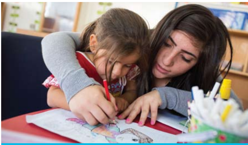
A Jordanian teacher with CRS partner Caritas Jordan helps a Syrian girl at the Zarqa Caritas Center, in Zarqa, Jordan. The classrooms offer informal education, as well as stability, safety, and counseling for issues of trauma and grief.