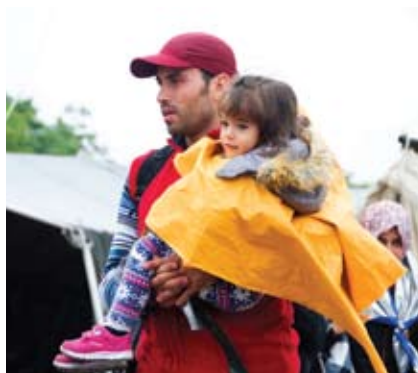
A father and daughter at a transit point in northern Serbia, where CRS provides medical and translation assistance, and supplies.

CRS and our partners in Greece, Macedonia, Serbia, Croatia, Albania and Germany are providing thousands of refugees with food, clothing, sanitation and temporary shelter. We have also provided legal and interpretation services to help refugees make informed decisions. Our support helps those who are most vulnerable—typically women, children and the elderly. In addition to offering refugees services along their main migration route, CRS is preparing partners to respond in Montenegro, Bosnia and Herzegovina, Albania and Bulgaria, in case more borders close and the migration route changes.