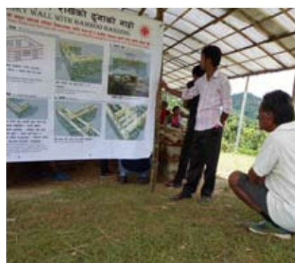
In Gorkha, community members view CRS demonstration models for rebuilding safe transitional homes.

QSAND draws on the features of a design and assessment method for buildings to promote and benchmark sustainable approaches to recovery and reconstruction. The course is designed for professionals with a focus on shelter and settlement to improve their skills and impact in ensuring lasting sustainability with their disaster recovery programming.