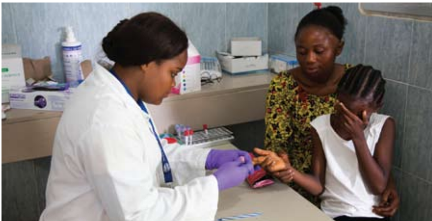
CRS helped St. Joseph's Catholic Hospital in Monrovia to reopen and provide laboratory services to screen patients for infectious diseases, including Ebola.

CRS' critical programming continues to focus on training in infection prevention and control, quality assurance monitoring, trauma and grief counseling, psychosocial support, food security and care of orphans. CRS will continue to play a major role in recovery. Watch a short video on YouTube about CRS' Ebola response: Responding to the Ebola Outbreak in West Africa .