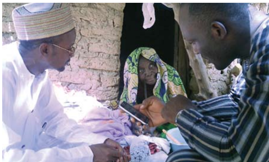
Vulnerable community members receive help registering for aid.

Currently, the U.N. Office for the Coordination of Humanitarian Affairs, or OCHA, estimates that 4.6 million people in the northeast lack access to sufficient food, and need immediate food assistance. Violence has disrupted people's ability to farm, herd livestock and trade goods. While overall food production in Nigeria is average or higher this year, displacement and insecurity have dramatically reduced production in Borno, northern Adamawa and southern Yobe. Boko Haram militants are preventing CRS partner staff from accessing some wards in Geidam, Yobe state.