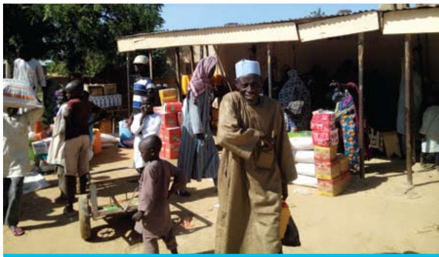
Beneficiaries redeem vouchers for vital food items. The United Nations estimates that 4.6 million people do not have access to sufficient food.