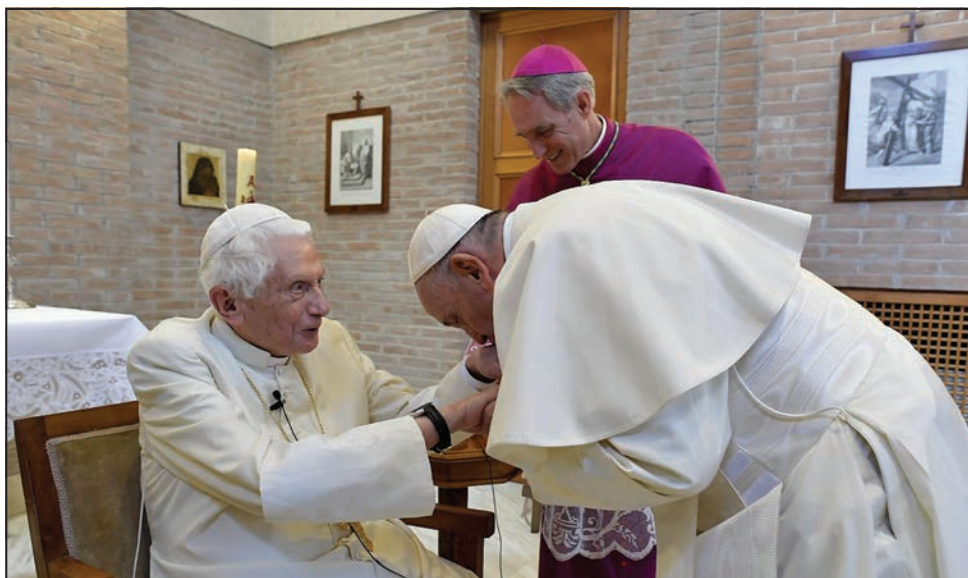
Retired Benedict XVI and Pope Francis exchange greetings at the Mater Ecclesiae Monastery after a consistory at which Pope Francis created 14 new cardinals at the Vatican on June 28. The new cardinals came to greet Pope Benedict.