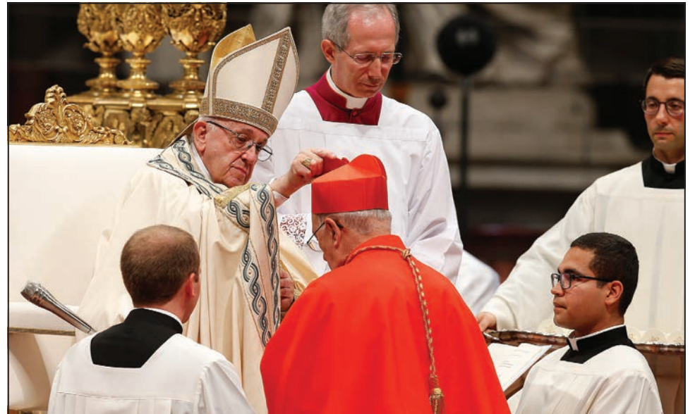
Pope Francis places a red biretta on new Cardinal Pedro Barreto of Huancayo, Peru, during a consistory to create 14 new cardinals in St. Peter's Basilica at the Vatican on June 28.