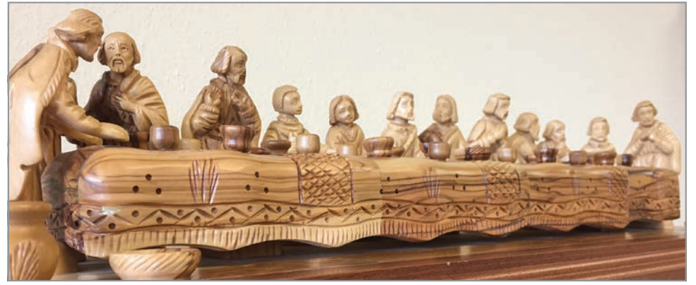
Depictions of the Last Supper, similar to this olive wood piece made in the Holy Land, will be on display during the summer festivals held at three of the four campuses of All Saints Parish in Dearborn County this summer.

He says the exhibits are more than just art, "but experiences where [visitors] are