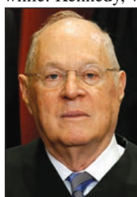
Justice Anthony Kennedy

Rumors about his retirement have been around for a while. Kennedy, who turns 82 in July, is the second-oldest member of the court after Justice Ruth Bader Ginsburg, who is 85. He also is the longest-serving justice currently on the court, appointed in 1988 by President Ronald Reagan.