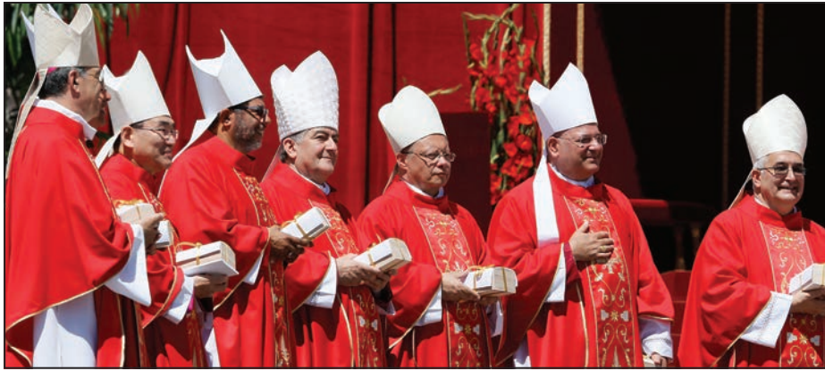
New archbishops hold boxes with palliums after receiving the boxes from Pope Francis during a Mass marking the feast of Sts. Peter and Paul in St. Peter's Square at the Vatican on June 29.