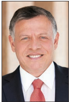
King Abdullah II

WEST CONSHOHOCKEN, Pa. (CNS)—King Abdullah II of Jordan has been chosen as the 2018 Templeton Prize Laureate.