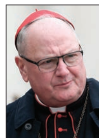
Cardinal Timothy M. Dolan

WASHINGTON (CNS)—The Supreme Court ruled 5-4 on June 26 that a California law that placed requirements on crisis pregnancy centers that oppose abortion violated the First Amendment.