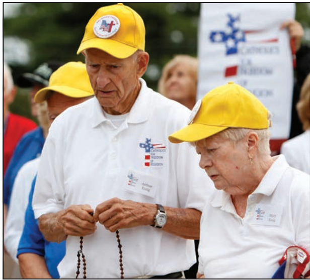
Participants recite the rosary during a religious freedom rally in 2016 at St. John the Baptist Diocesan High School in West Islip, N.Y.