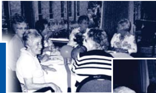
Photos from our recent Kitchen & Housekeeping 'shower'. Thanks again to all our volunteers