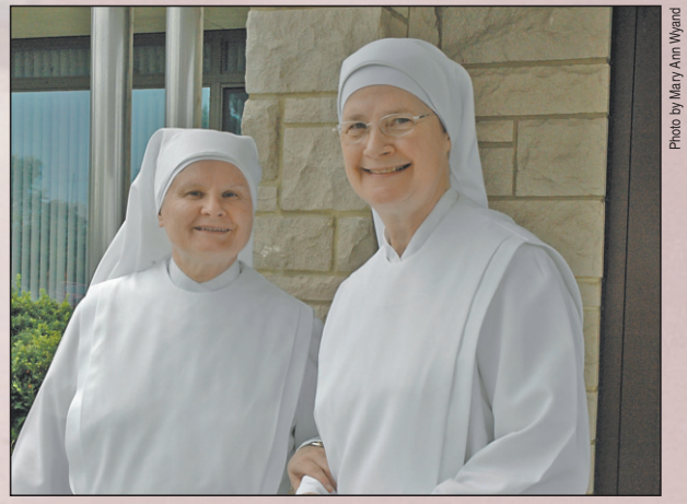
Little Sisters serve the elderly, page 18.