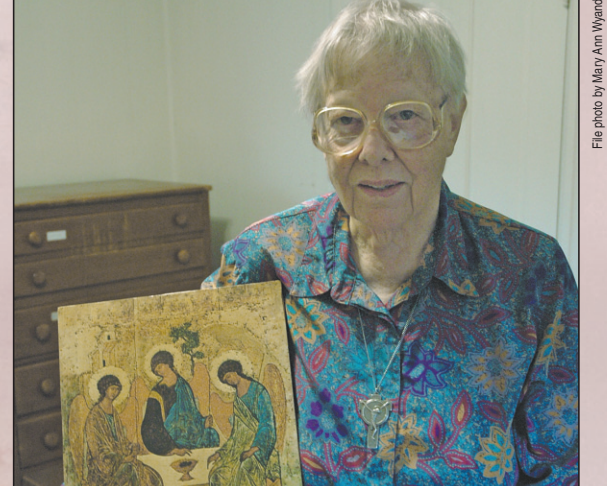
Franciscan sister leads parish, page 21.