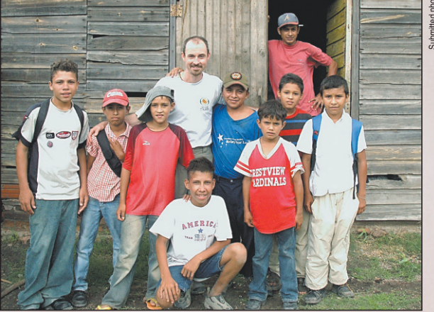
Seminarian helps people near and far, page 14.