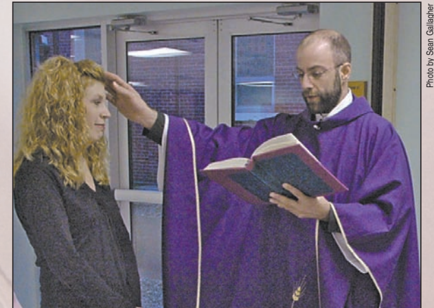
Priest builds community, page 17.