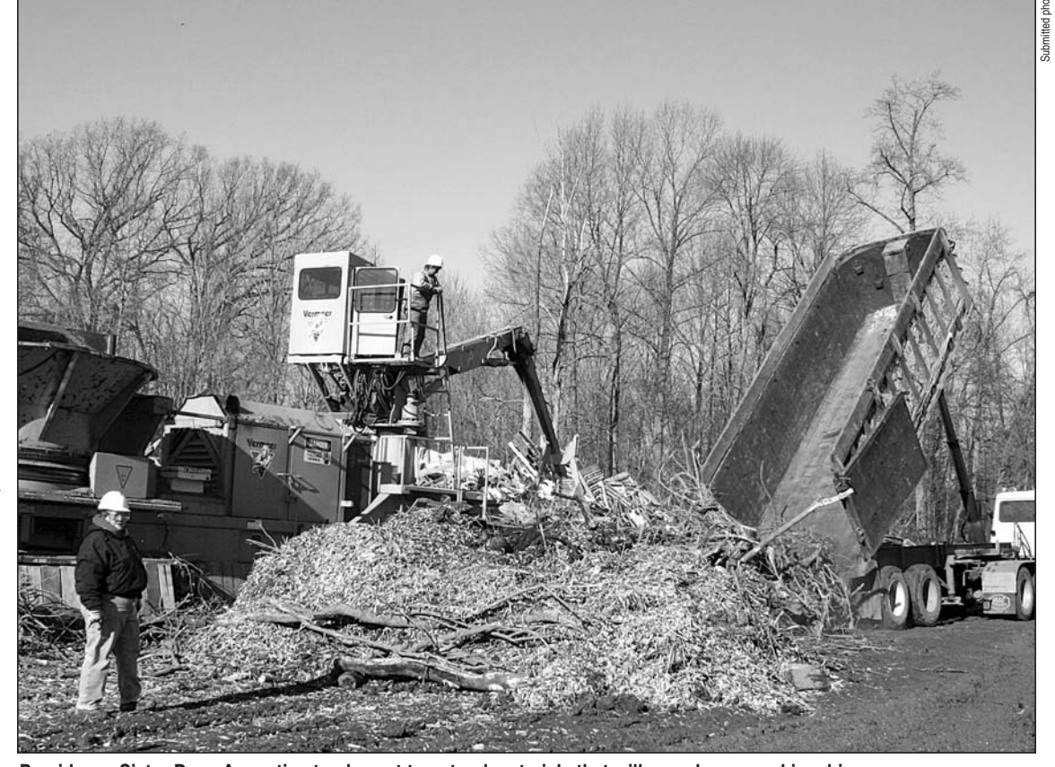
Providence Sister Dana Augustin stands next to natural materials that will soon be re-used in a biomass energy process to provide heat for her congregation's motherhouse at Saint Mary-of-the-Woods.