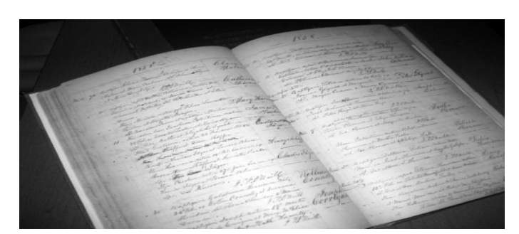
CATHOLIC ARCHDIOCESE OF INDIANAPOLIS