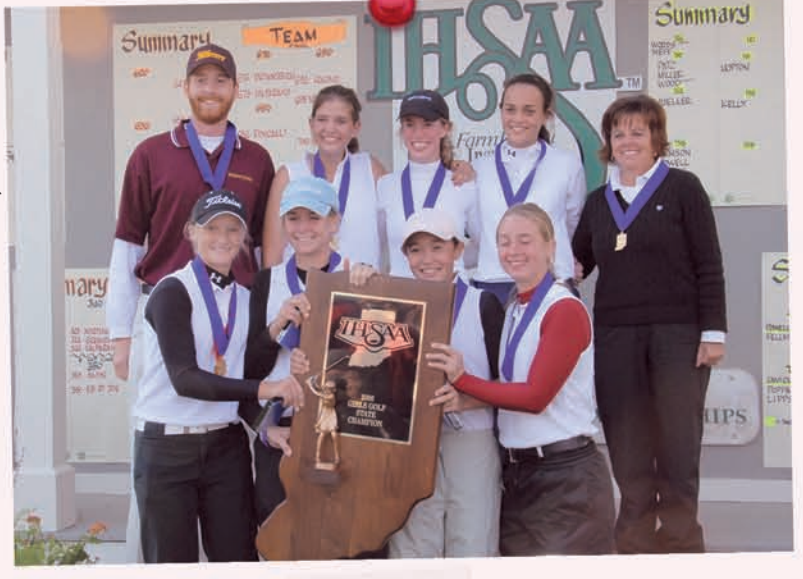
Members of the Brebeuf girls' golf team and coaches are all smiles after capturing the state championship trophy.