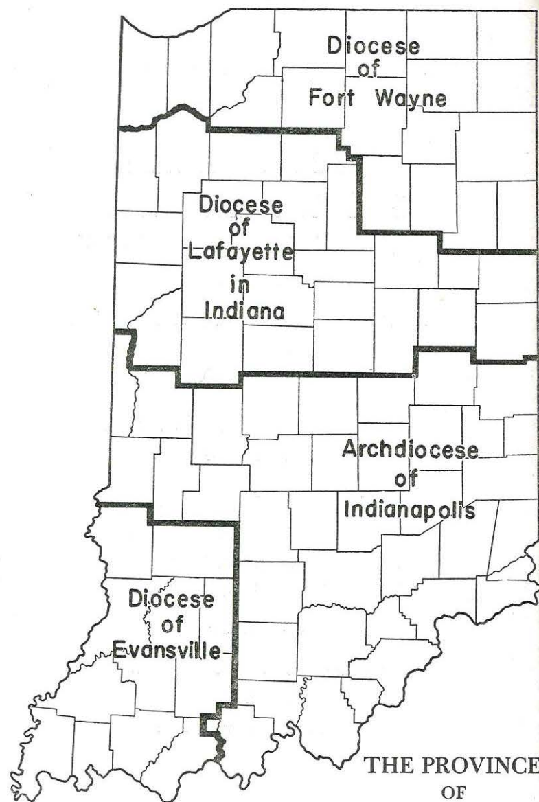
THE PROVINCE OF INDIANAPOLIS DECEMBER 19, 1944